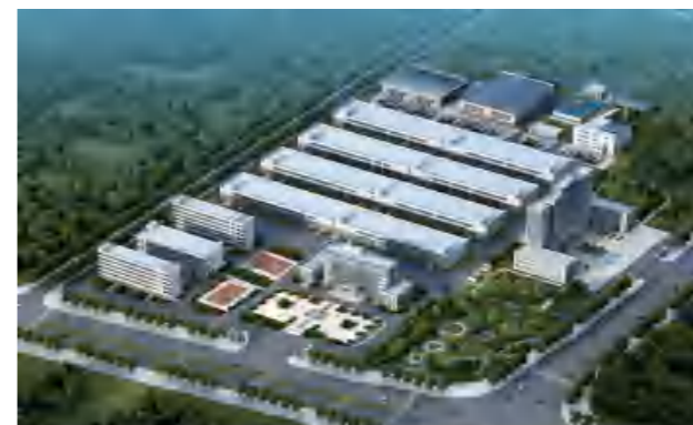
湖南省恭兵食品有限公司特色豆制品项目规划