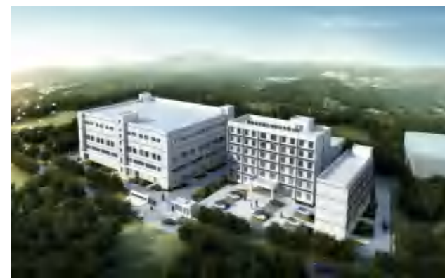
湖南省和鑫生物科技有限公司葛根绿色食品项目