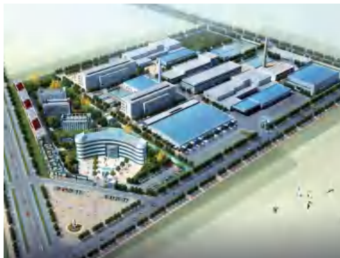
湖南鸿鹰祥生物工程有限公司酶制剂项目