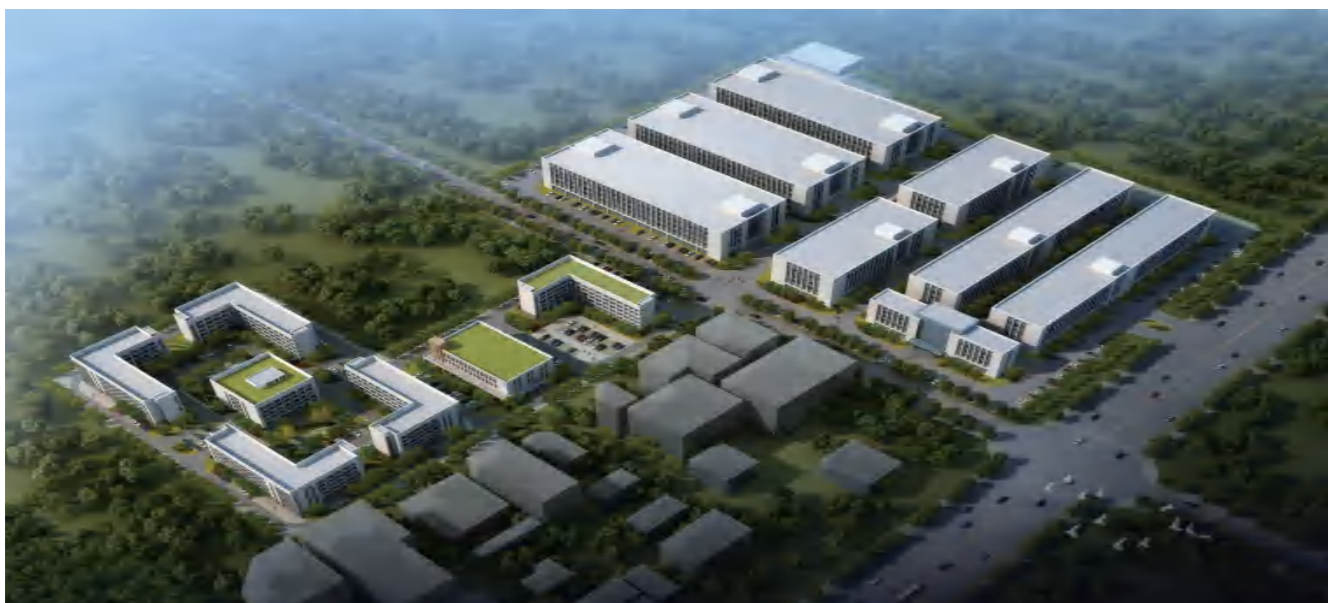
湖南桃源县漳江创业园标准厂房建设项目