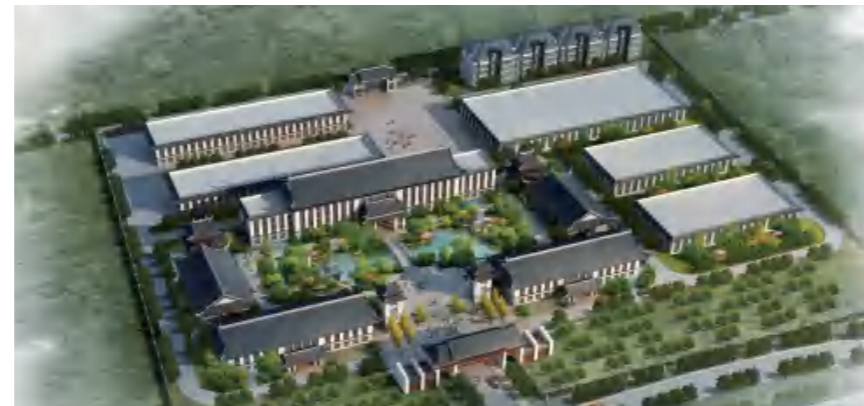
澧县太青山有机食品有限公司“双上绿芽”茶叶产业基地建设项目规划