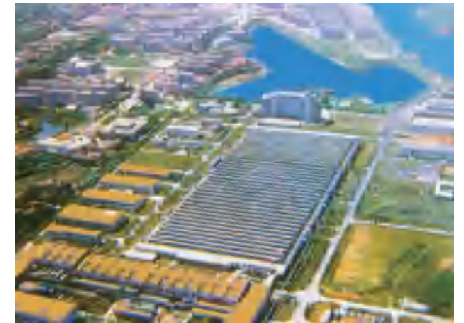
湖南洞庭苧麻纺织印染厂

(1) <Regulations for Fire Protection in Textile Engineering Design> and <Estimation Index of Investment in Textile Industry Construction>.