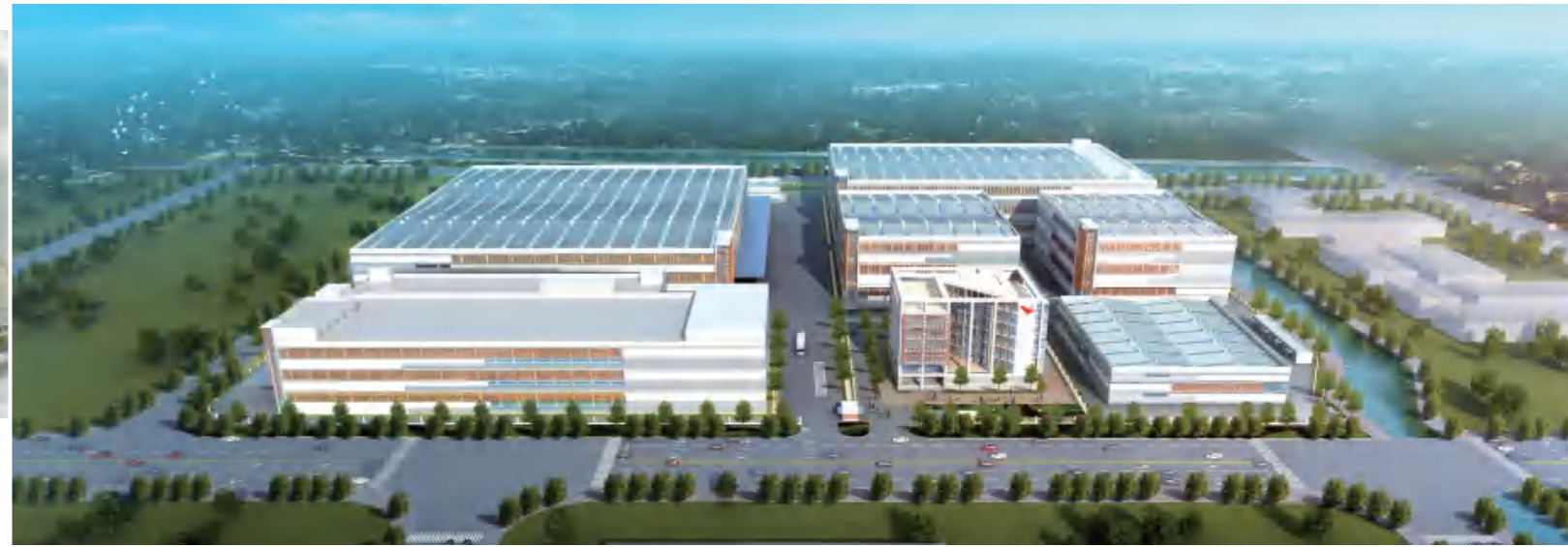
上海统一企业饮料食品有限公司建设饮料和方便面生产线项目二期