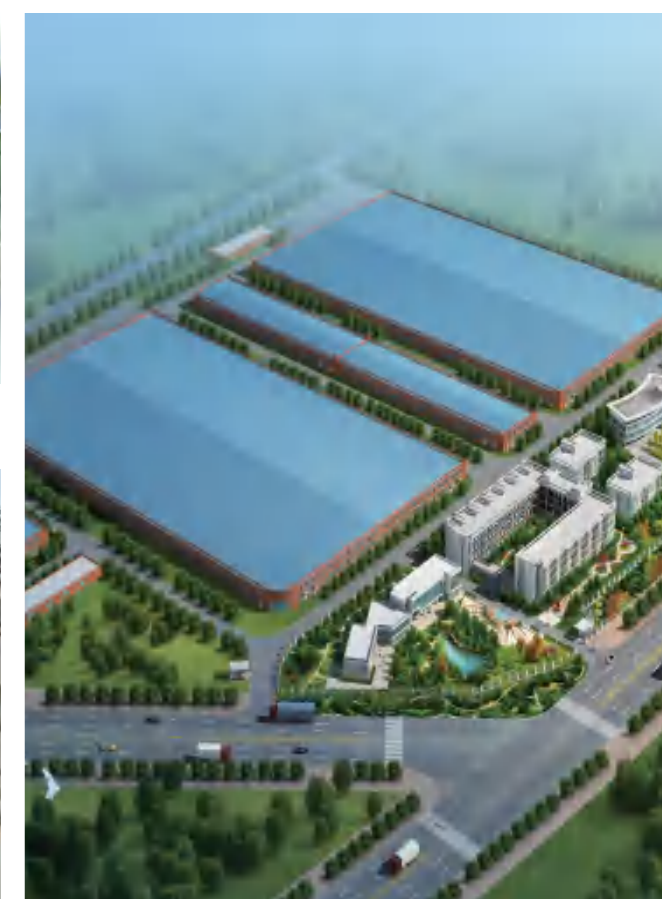
湖南科力嘉纺织股份有限公司建设生态环锭生产线项目一期